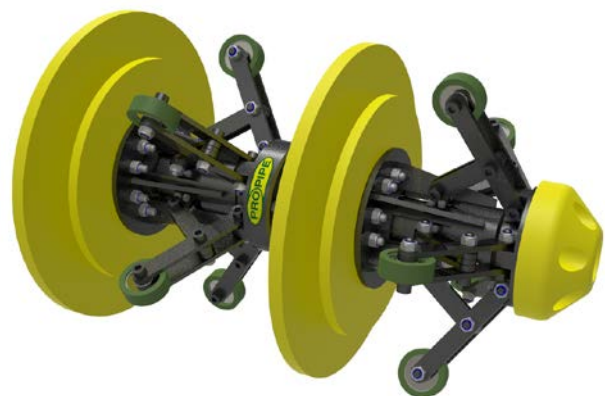
3D CAD & Analysis Facilities